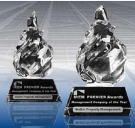
Sudler Property Management is the recipient of the IREM Property Management Company of the Year award.